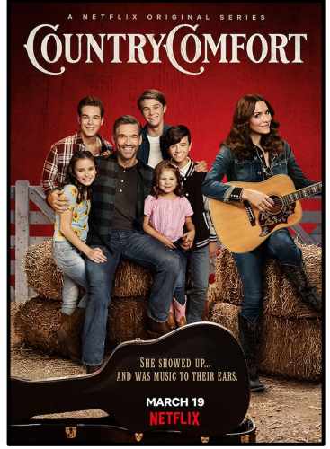
Country Comfort Available on Netflix

made it a point to just be kind, and how to love yourself. She is an influence to younger people because she is teaching them how to respect themselves and others because "strong people lift others up and never bring them down."